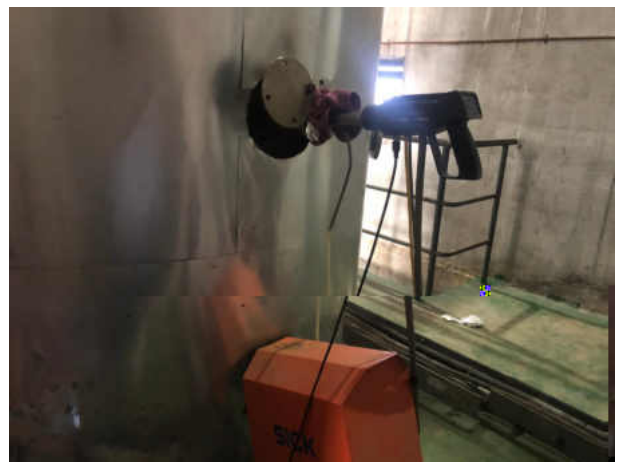
1# DA001 1